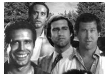
Thursday: The convention of Chevy Chase near-look-alikes meet for the first time, in Wisconsin. Topics discussed included "How it's not cool anymore to look like Chevy Chase"

What is readme? Well, it's funny and it's useful. And free. So it's pretty much the best thing going.