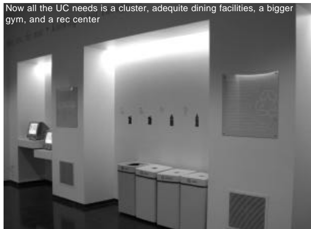
Now all the UC needs is a cluster, adequate dining facilities, a bigger gym, and a rec center

From the first floor of the University Center, leading outside, you may have noticed a green hallway. This is the University Center Recycling Room , and it was installed by Green Practices last April in honor of Earth Day 2002. You can find it directly opposite McConomy Auditorium, and it is there so that you can be more environmentally conscious about your waste disposal.