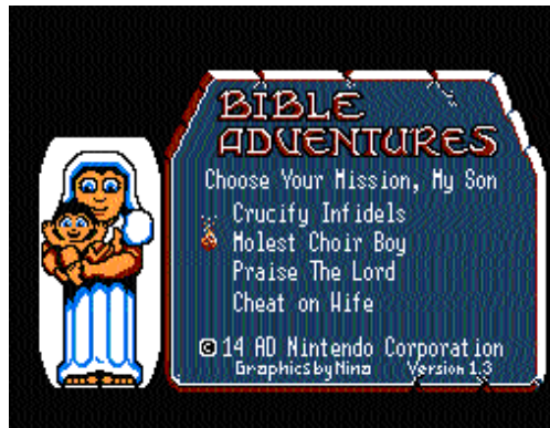
The recently unearthed "Dead Sea Cartridge"