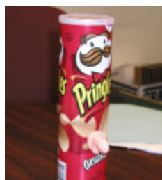
Wednesday: Pringles introduces its new anatomically correct packaging. 'Lays' potato chips refuse comment