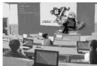
Professor The Shredder lectures at CMU's Dimension X Campus

schools culminated in the murder of Tupac Shakur and Biggie Smalls in the late 90's.