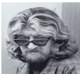
Tuesday: Donatella Versace unveils this season's line. Crazy-Homeless-Chic, predicted to take fashion world by storm.