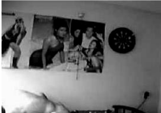
"I think I can make out a...oh no, wait that's a knee